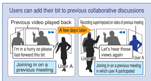
Participating in meetings across time differences