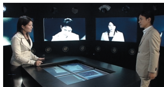
Demonstrating the system